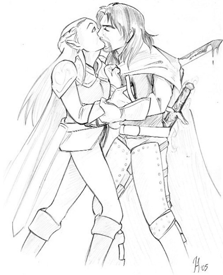
What dramatic twists lay ahead for the heroes of Gate Pass?

Material Component: Ten gold coins which have sat in a fire for at least one hour.