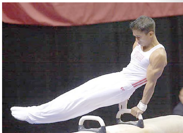
Our use of the term “gymnastics” includes all activities where the aim is body control.

While developing your upper body strength with the pull-ups, push-ups, dips, and rope climb, a large measure of balance and accuracy can be developed through mastering the handstand. Start with a headstand against the wall if you need to. Once reasonably comfortable with the inverted position of the headstand you can practice kicking up to the handstand again against a wall. Later take the handstand to the short parallel bars or parallettes ( http://www.american-gymnast.com/technically_correct/paralletteguide/titlepage.html ) without the benefit of the wall. After you can hold a handstand for several minutes without benefit of the wall or a spotter it is time to develop a pirouette. A pirouette is lifting one arm and turning on the supporting arm 90 degrees to regain the handstand then repeating this with alternate arms until you’ve turned 180 degrees. This skill needs to be practiced until it can be done with little chance of falling from the handstand. Work in intervals of 90 degrees as benchmarks of your growth – 90, 180, 270, 360, 450, 540, 630, and finally 720 degrees.