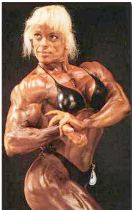
Fit or Grotesque?

The benefits of Olympic weightlifting don't end with strength, speed, power, and flexibility. The clean and jerk and the snatch both develop coordination, agility, accuracy, and balance and to no small degree. Both of these lifts are as nuanced and challenging as any movement in all of sport. Moderate competency in the Olympic lifts confers added prowess to any sport.